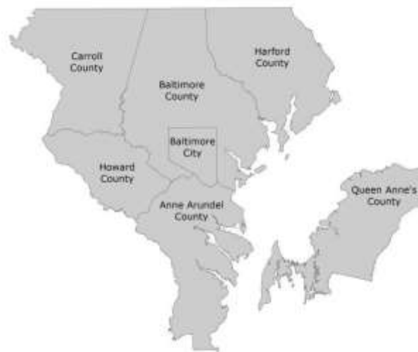
Figure 1- Baltimore Metropolitan Planning Area

At a minimum, a Metropolitan Planning Area (MPA) must cover the urbanized area and contiguous geographic areas likely to become urbanized within the next 20 years. The Baltimore MPA consists of Baltimore City; all of Anne Arundel, Baltimore, Carroll, Harford, and Howard counties; and a portion of Queen Anne's County (see Figure 1 for the geographic location of each participating local jurisdiction).