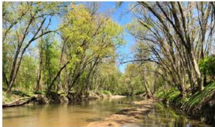
① Patapsco River at Proposed Bridge