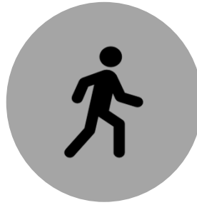
HEALTHY, EFFICIENT MODE OF TRANSPORTATION