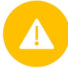
MOST AT RISK