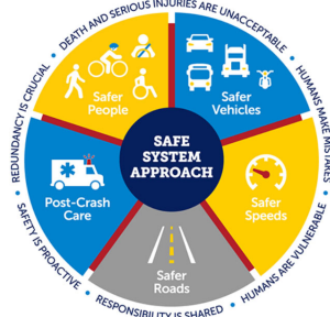
SAFE SYSTEM APPROACH