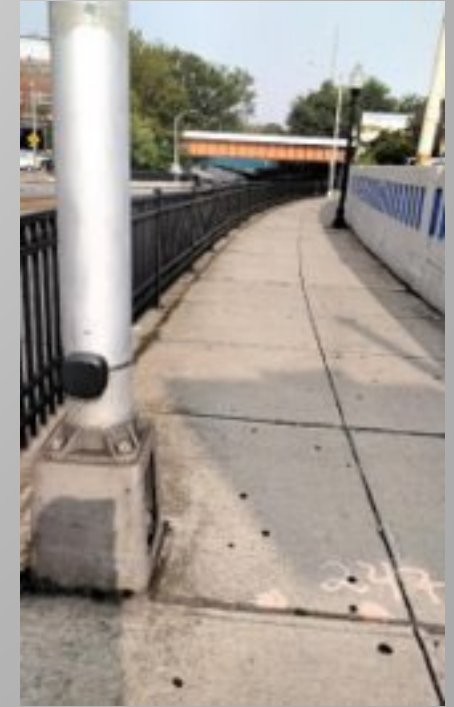
PYRO Box Evo- S Macon St