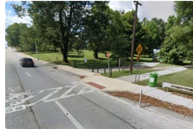
Bel air Rd Entrance