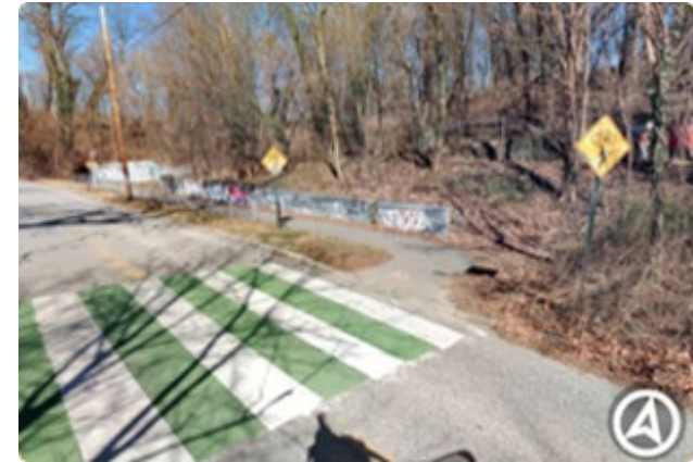
Falls Road Crossing