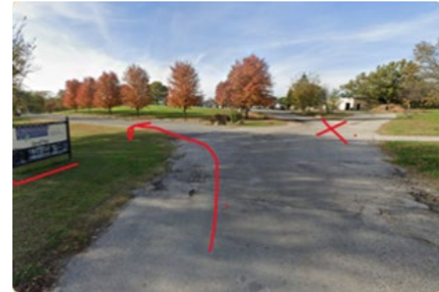
Carroll Park Trail Head