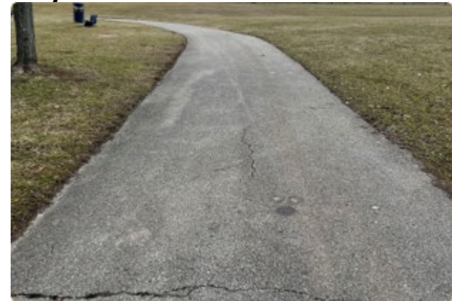
Gwynn's Fall Trail : Right Side