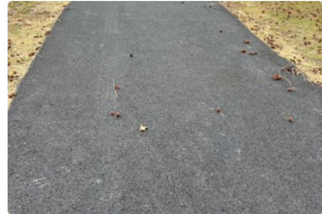
Gwynn's Falls Trail: Left Side