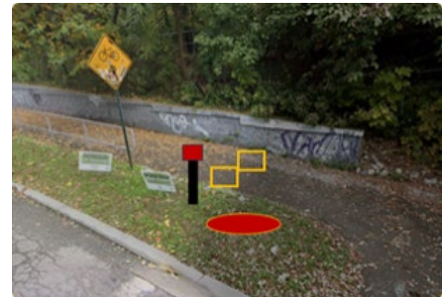
Trail Counter location