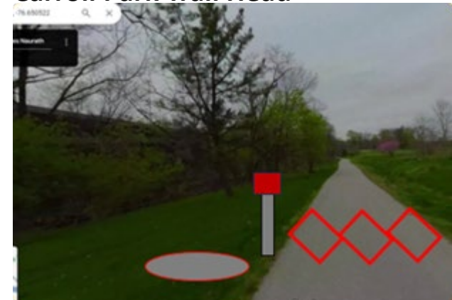
Trail Counter Location