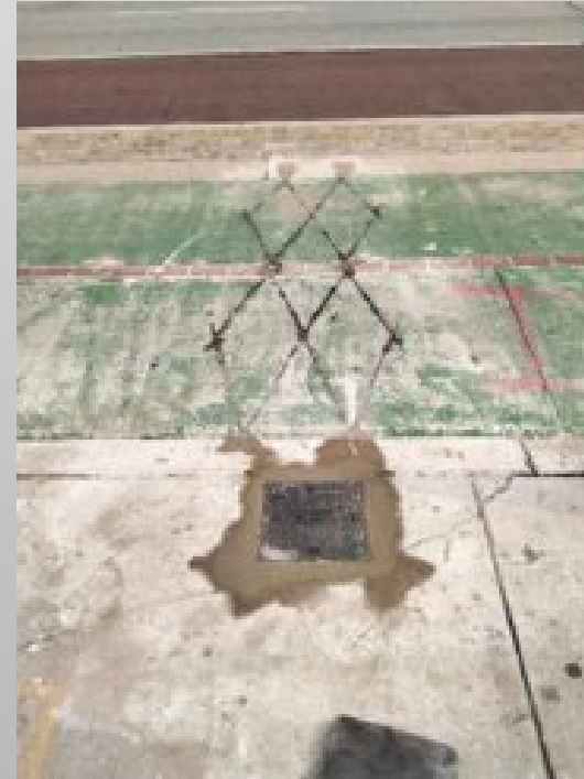
ZELT Counter – Jones Falls Trail