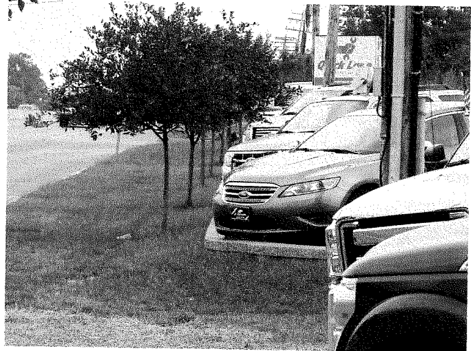
US 40 (Pulaski Highway) between Mohrs Rd and Middle River Rd